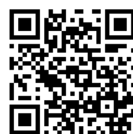
TSU Human Resources