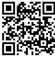
UT Human Resources