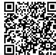
Flexible Work Guidelines