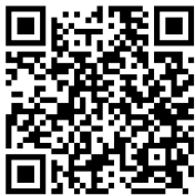
Extension HR Policy and Guidance